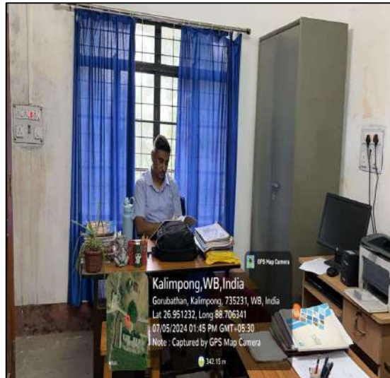
STAFF ROOM (DEPARTMENT OF HINDI)