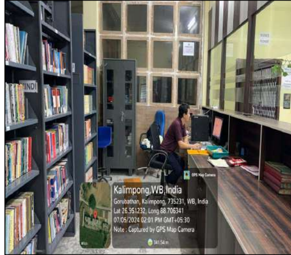
ICT ENABLED ROOM