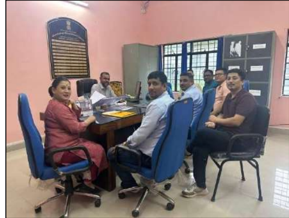
STAFF ROOM (DEPARTMENT OF BOTANY)